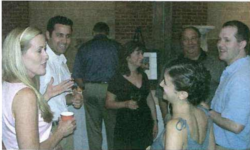
Party-goers discuss the event.